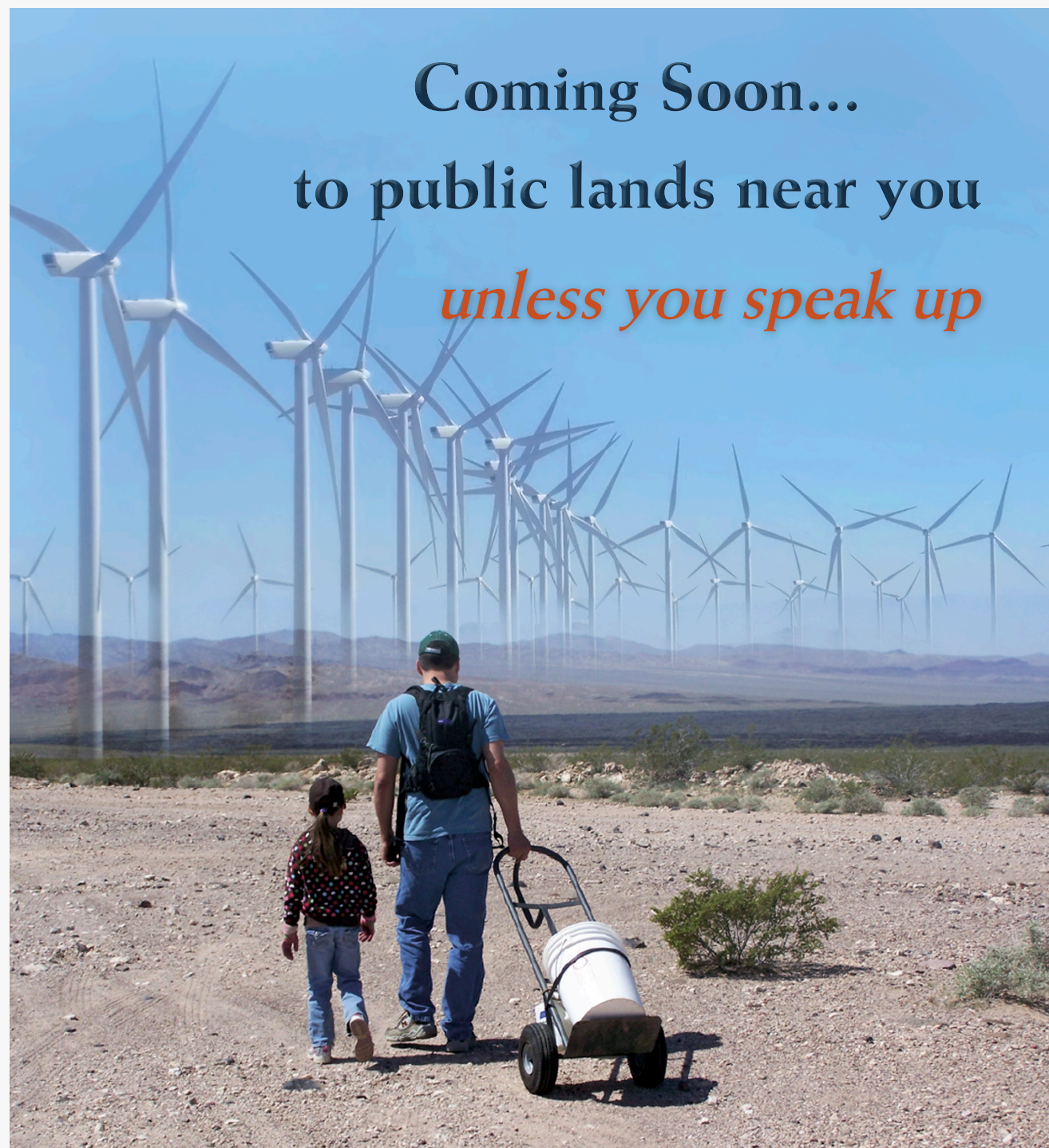
Cover. (Composite photo) Father and child at Lavi Siding rock collecting area, Mojave Desert, by Kris Rowe; wind turbines by Wiki user Z22.

The comment period on the DRECP has been extended through February 23, 2015.