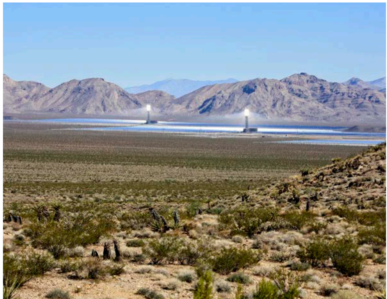
The Ivanpah Solar Electric Generating System is a concentrated solar thermal plant located at the base of Clark Mountain in California's Mojave Desert, across the state line from Primm, Nevada. It is the largest solar farm of its kind in the world. Photo: Camden Bruner, BLM, 13 July 2008.

In total, the plan protected more land from energy projects than the area of all three of the Desert's national parks, combined. This is an incredible achievement for those residents and visitors who cherish this landscape.