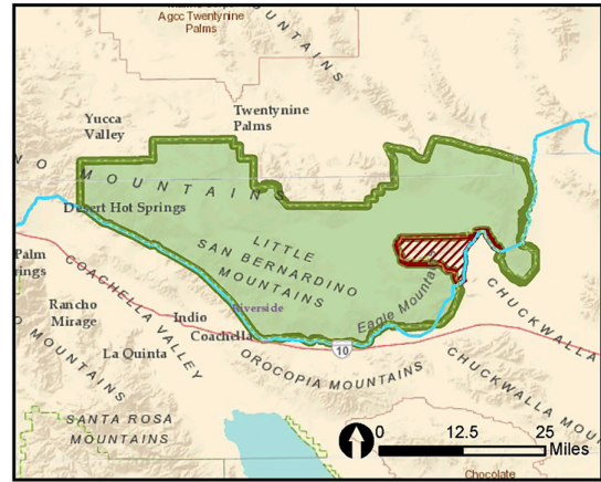
Joshua Tree National Park boundary, 1994 to present. Map: National Park Service.

And now it appears that Eagle Mountain not only will debar hobby collecting, but also may debar life itself in the desert. Cadiz and Eagle Mountain are not small sacrifices for a greater good. Cadiz has not had environmental review and previous federal review of